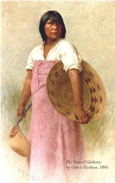
The Tarweed Gatherer, by Grace Hudson, 1896